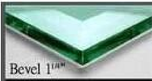
Bevel 1 mm