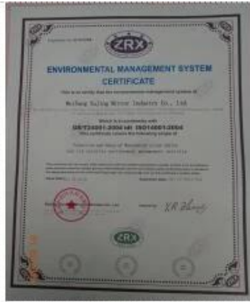
ISO 14001 Certificate