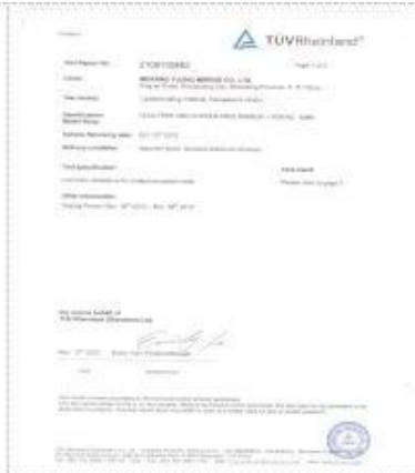
TUV CASS test report I