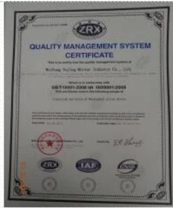
ISO 9001 Certificate