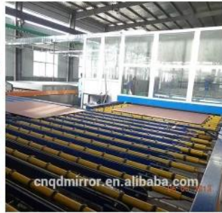
Mirror Production Line