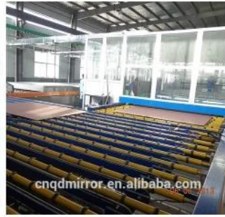
Mirror Production Line