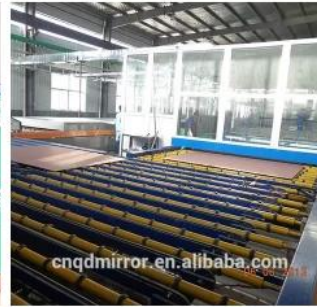
Mirror Production Line