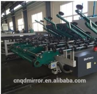
Automatic Glass Cutting Line