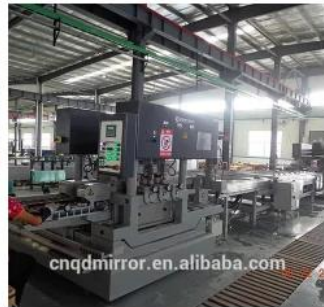
Automatic Glass Edging Line