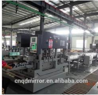
Automatic Glass Edging Line