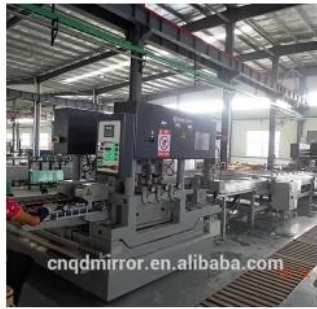
Automatic Glass Edging Line