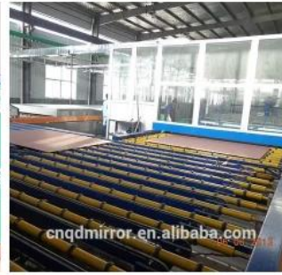
Mirror Production Line