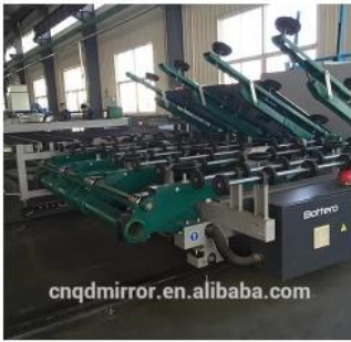
Automatic Glass Cutting Line