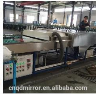
Glass and Mirror Cleaning Line