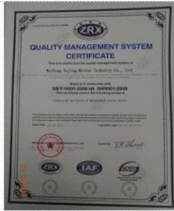
ISO 9001 Certificate