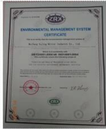
ISO 14001 Certificate