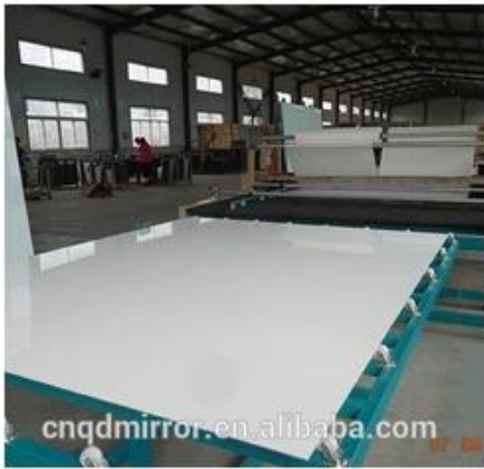
Film Covering Line (CAT I&II)