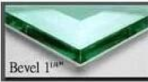
Bevel 1 mm