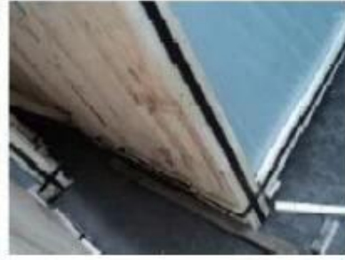
Bottom of crates