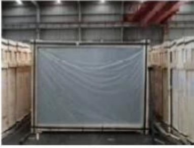
Front of crates