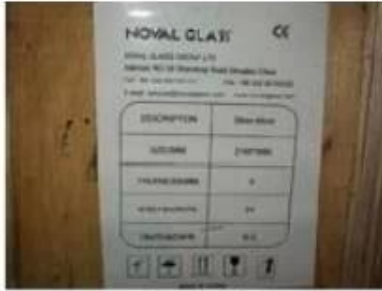
Note on crates