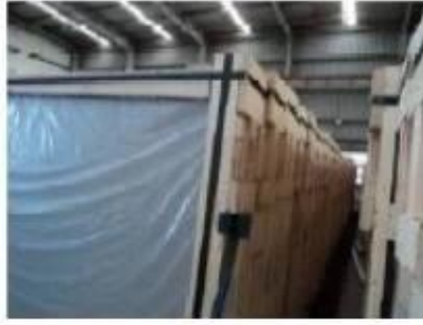
Top of crates