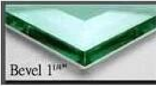
Bevel 1 mm