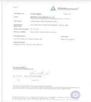
TUV CASS test report I