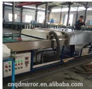
Glass and Mirror Cleaning Line