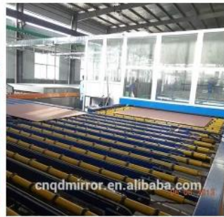
Mirror Production Line