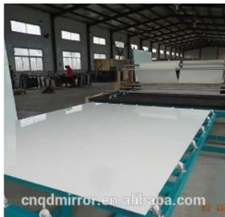
Film Covering Line (CAT I&II)