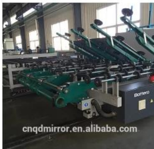
Automatic Glass Cutting Line