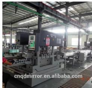
Automatic Glass Edging Line