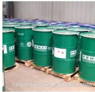
Raw Material: Italy FENZI Paint