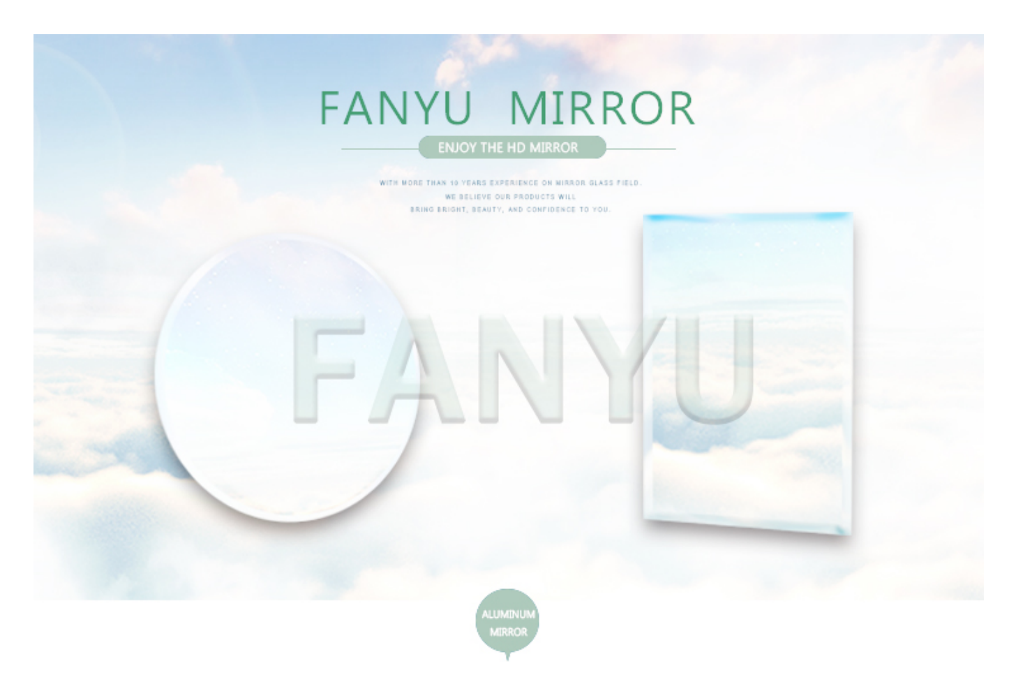
2017 Hot sale aluminum mirror with CE&ISO cetification