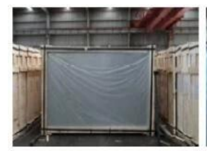
Front of crates