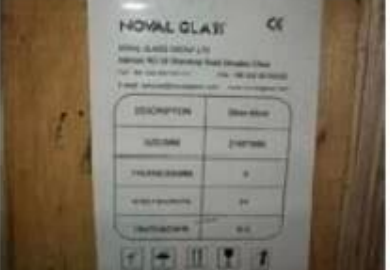
Note on crates