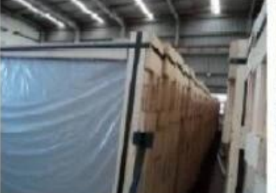
Top of crates