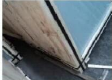
Bottom of crates