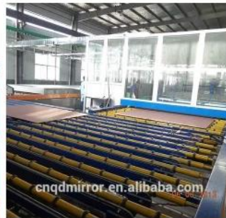
Mirror Production Line