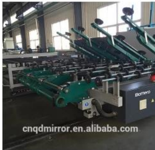
Automatic Glass Cutting Line