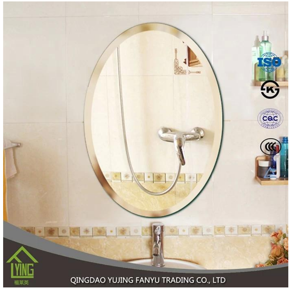
Packaging & delivery