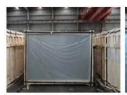
Top of crates