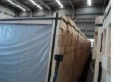
of crates Bottom of crates