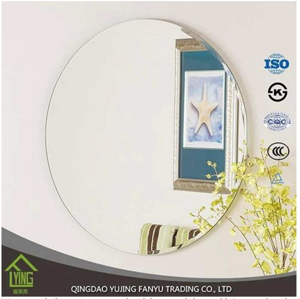
Waterproof silver mirror is used widely around the world. It is produced with high quality clear float glass and two layers of grey, bronze, green or other colors of Italy FENZI paint.