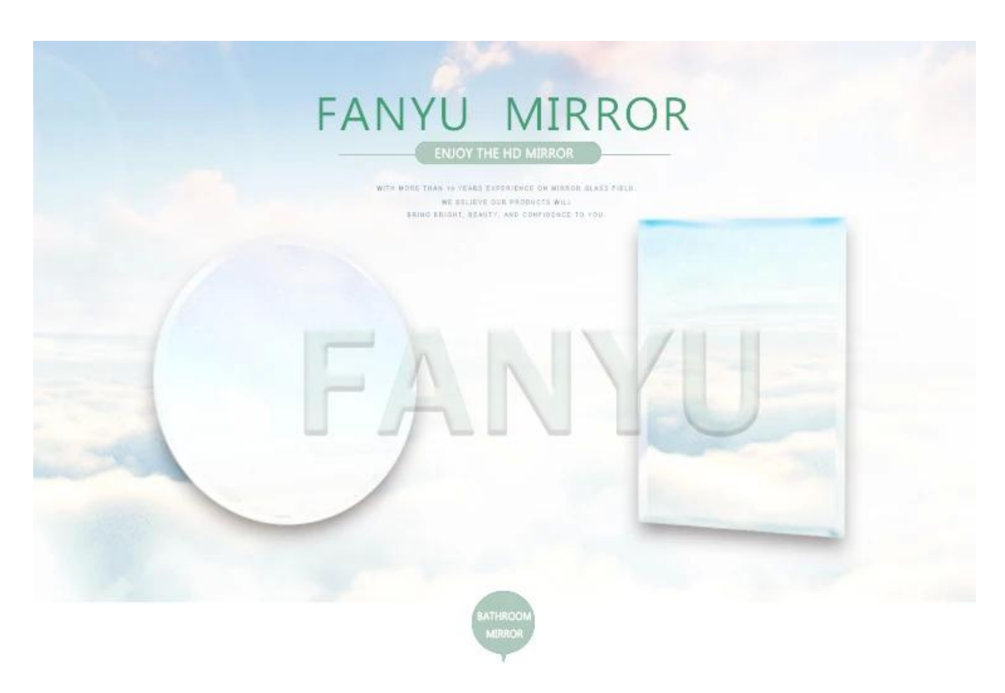
High quality modern bathroom with multi-style silver mirror