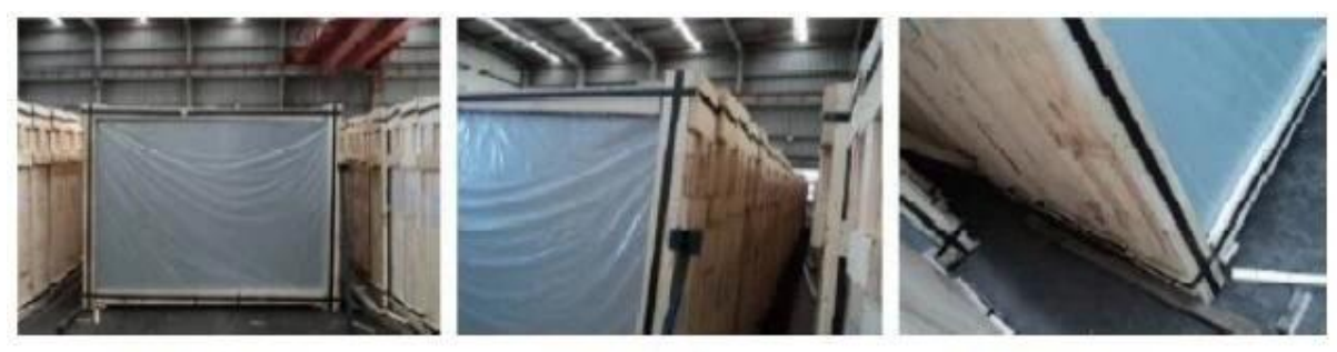
Front of crates