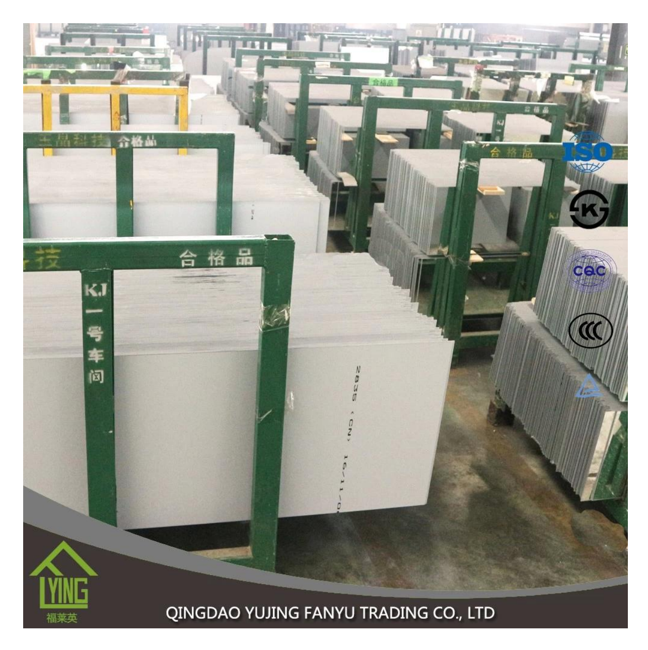
Packaging & delivery