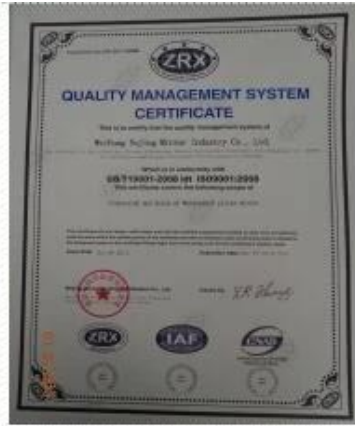
ISO 9001 Certificate