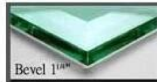
Bevel 1 1/4"