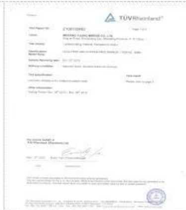
TUV CASS test report I