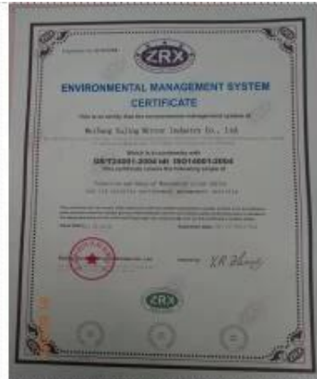
ISO 14001 Certificate