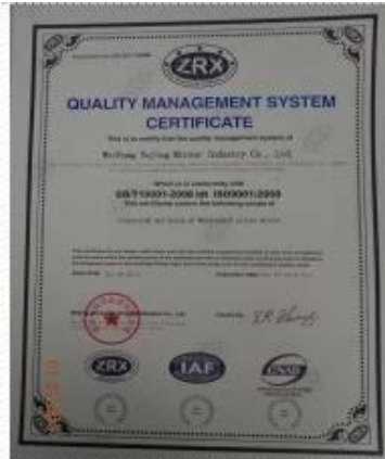
ISO 9001 Certificate