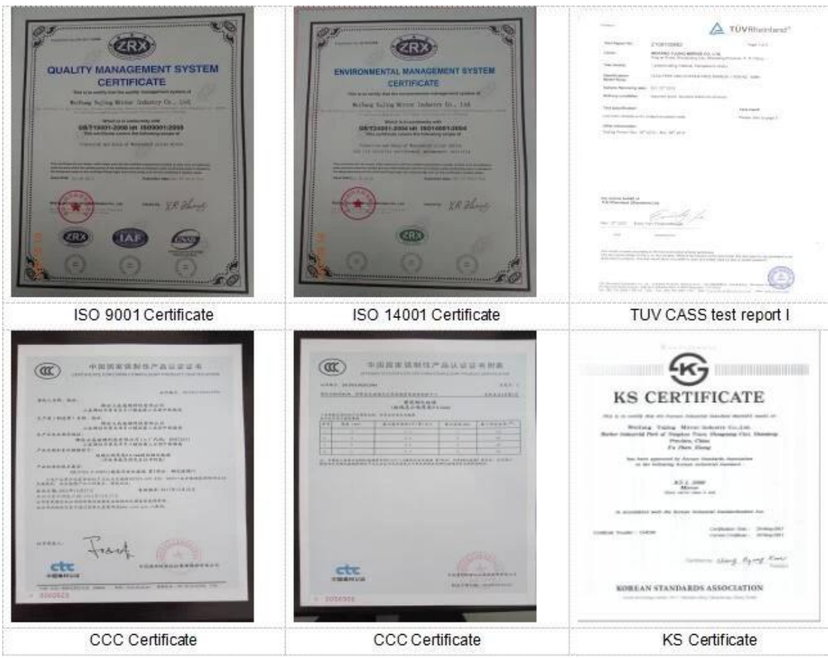
ISO 9001 Certificate